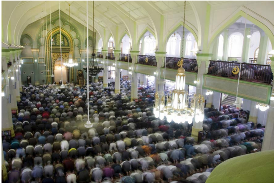
Friday prayers at Sultan Mosque